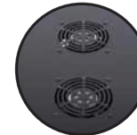
2-way Fan kit installed