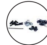
Cage nuts & screws included