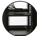
1 x Fixed shelves