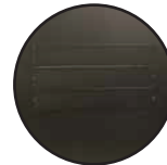
Cable access points in base, rear & roof