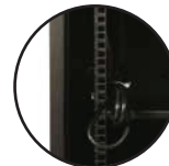
Screenprinted mounting rails