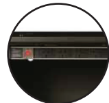
6-way Horizontal rackmount power rail