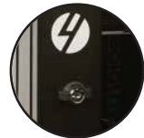
Lockable front & rear doors