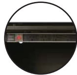
6-way Horizontal rackmount power rail