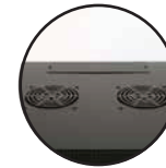
2-way Fan kit installed