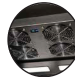
4-way ceiling fan kit installed