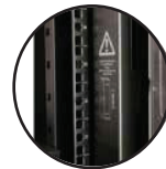
Screenprinted mounting rails