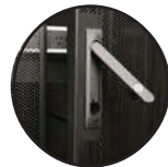
Lockable front & rear doors