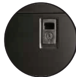
Lockable side panels