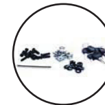
Cage nuts & screws included