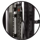
2 X PDU mounting rails