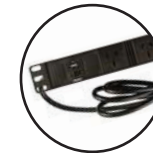
Quality power rail installed