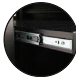
2 x Fixed shelves & 1 sliding shelf installed